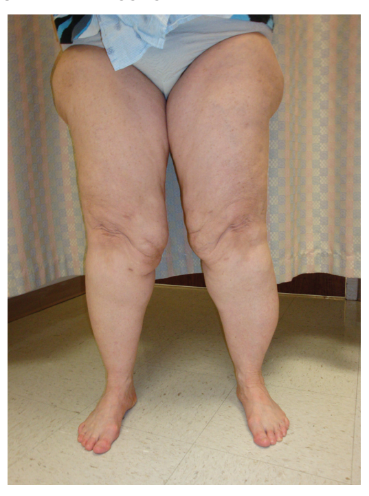
Figure 8. STAGE II LIPEDEMA WITH IRREGULAR SKIN AND NODULAR FAT DEPOSITS

of fat that overlay enlarged lower extremities or hips<sup>20,26</sup> or even upper arms (Figures 5 and 10). Some patients may present with a hybrid of both types. The authors have noted a "Michelin tire" presentation (Figure 11; a severe columnar form), as well as a "jodhpurs" appearance (Figure 12; a severe lobar pattern).