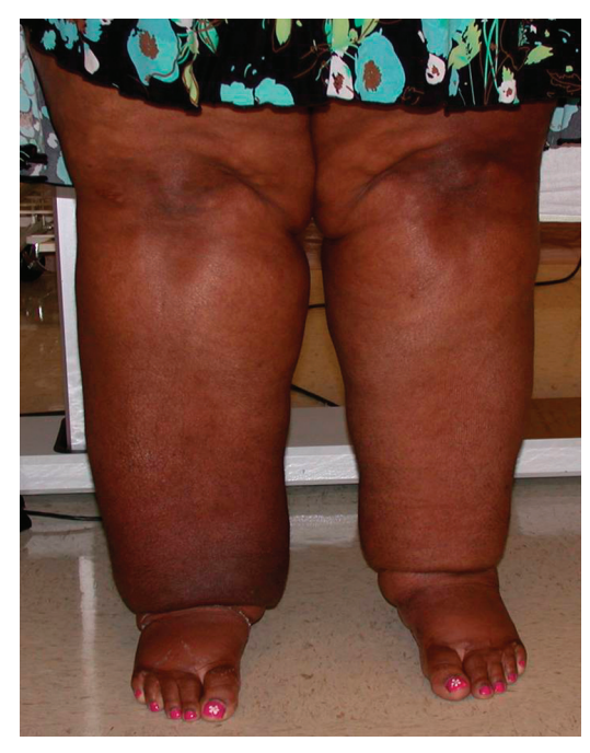
Figure 4. BILATERAL FAT-PAD SIGN AT ANKLES

patients with lipedema, excessive fat deposition was restricted to the legs in two-thirds, but only 3% had lipedema solely in the arms. In contrast, whereas 97% of the patients had lipedema in the legs, it was also present in the arms of 31% of the patients, suggesting that arm involvement is probably common.