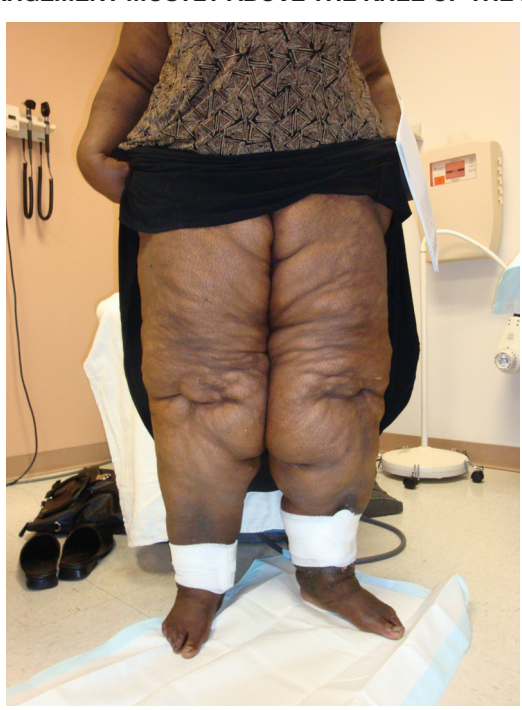
Figure 9. ENLARGEMENT MOSTLY ABOVE THE KNEE OF THE LEGS

nous insufficiency, although some minor impairment of venous function may be apparent.<sup>13</sup> Distinguishing obesity from lipedema can be accomplished by noting ( a ) whether the fat