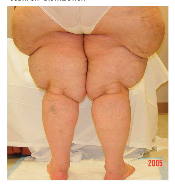
Figure 12. UPPER THIGH LIPEDEMA LYMPHEDEMA IN A "JODHPUR" DISTRIBUTION

and/or physical activities reduce truncal adiposity but not extremity adiposity (Table 1).<sup>33</sup> Easy bruising is often noted. Pain upon pressure is universal in patients with lipedema and is commonly described an "aching dysesthesia."<sup>10,34</sup>