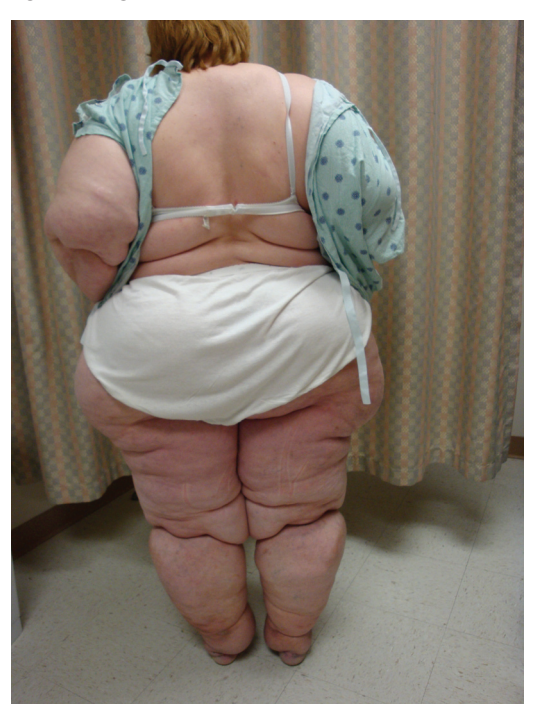
Figure 6. STAGE III LIPEDEMA WITH LARGE DEFORMING FAT DEPOSITS; NOTE SIZE DIFFERENCE BETWEEN UPPER AND LOWER BODY