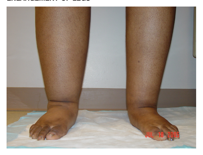
Figure 2. LIPEDEMA WITH SPARING OF FEET DESPITE ENLARGEMENT OF LEGS