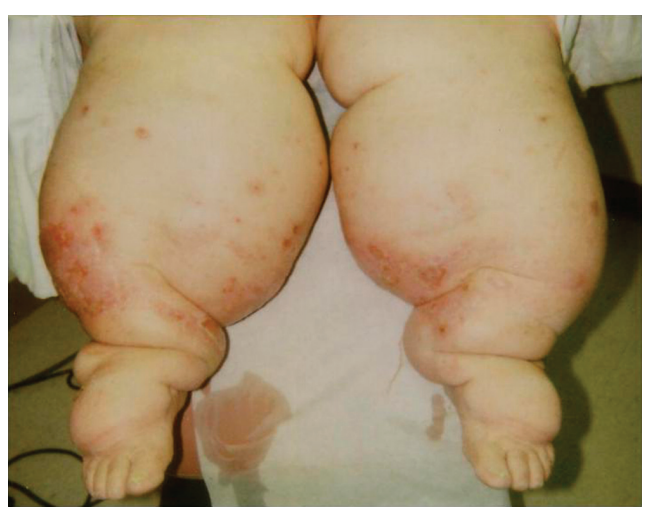
Figure 13. LIPEDEMA WITH SEVERE SECONDARY LYMPHEDEMA AND DRAINING WOUNDS; THE FEET ARE NOW AFFECTED

In many women, lipedema will remain relatively stable, but in a proportion of patients, a gradual progression is observed, and in some, an abrupt development of the condition and/or evolution to lipolymphedema can occur (Figures 13 and 14). Exacerbation can be caused by pregnancy or surgery <sup>35,36</sup> or some trauma, reminiscent of the triggers for primary lymphedema. <sup>31</sup> It can be quite difficult when the clinician is presented with an advanced case of lipolymphedema, particularly in an obese patient, to know what the course of development was—for example, whether obesity and obesity-related sequelae, such as recurrent cellulitis or heart failure, predisposed the patient toward lymphedema at some stage following a stable