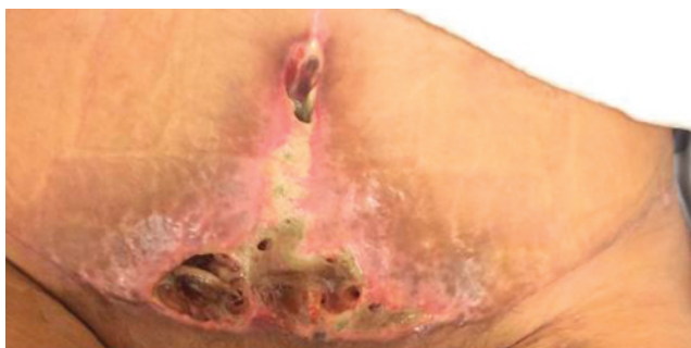
Figure 5. POSTSURGICAL WOUNDS

A 40-year-old woman with full-thickness skin loss following abdominoplasty.