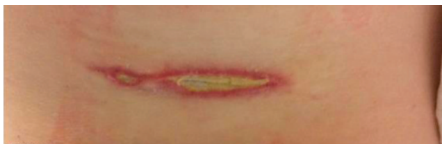
Figure 4. POSTSURGICAL WOUNDS

A 30-year-old woman with full-thickness skin loss following nevus removal toward the left lower abdomen.