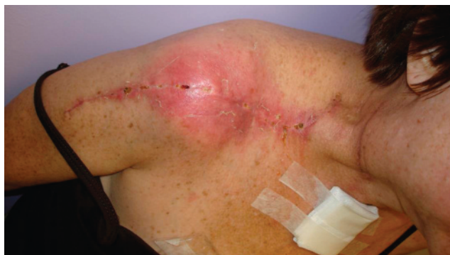
Figure 6. POSTSURGICAL WOUNDS

A 54-year-old woman with cellulitis of a right supraclavicular flap donor site.